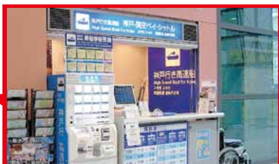
Kobe-Kansai Airport Bay Shuttle Ticket Counter